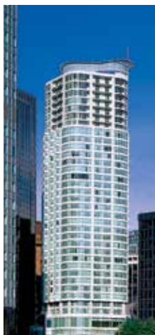
Marriott Pinnacle Hotel, Vancouver