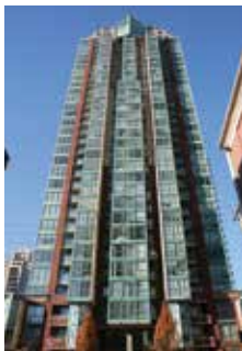
The Pinnacle, Vancouver