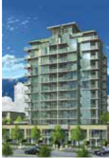
Esplanade West, North Vancouver