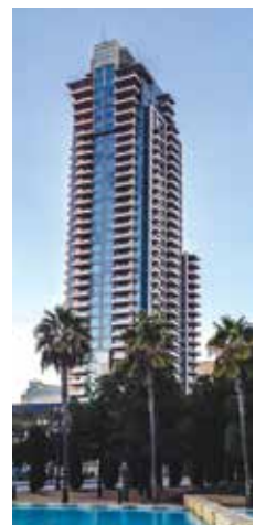
Pinnacle Museum Tower, San Diego