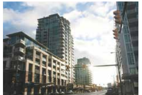
Esplanade, North Vancouver