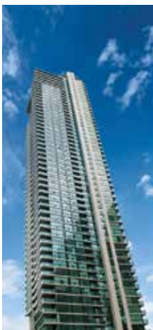
16 Harbour Street, Toronto