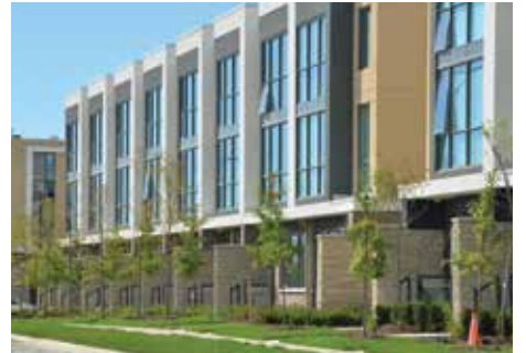
The Marquee Townhomes, Mississauga