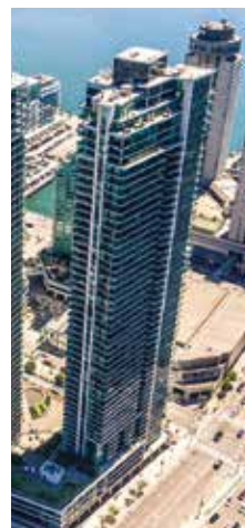
33 Bay Street, Toronto