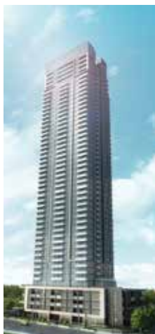
Pinnacle Grand Park 2, Mississauga