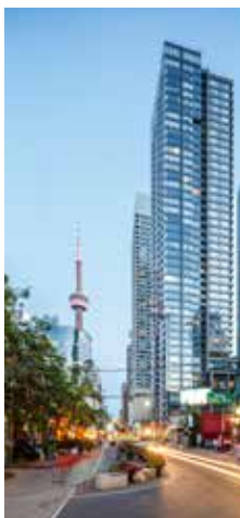
The Pinnacle on Adelaide, Toronto