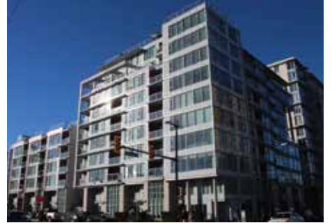
Pinnacle Living False Creek, Vancouver