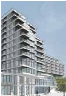
Pinnacle Residences at the Pier, North Vancouver