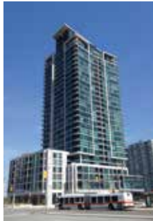
Pinnacle Grand Park, Mississauga