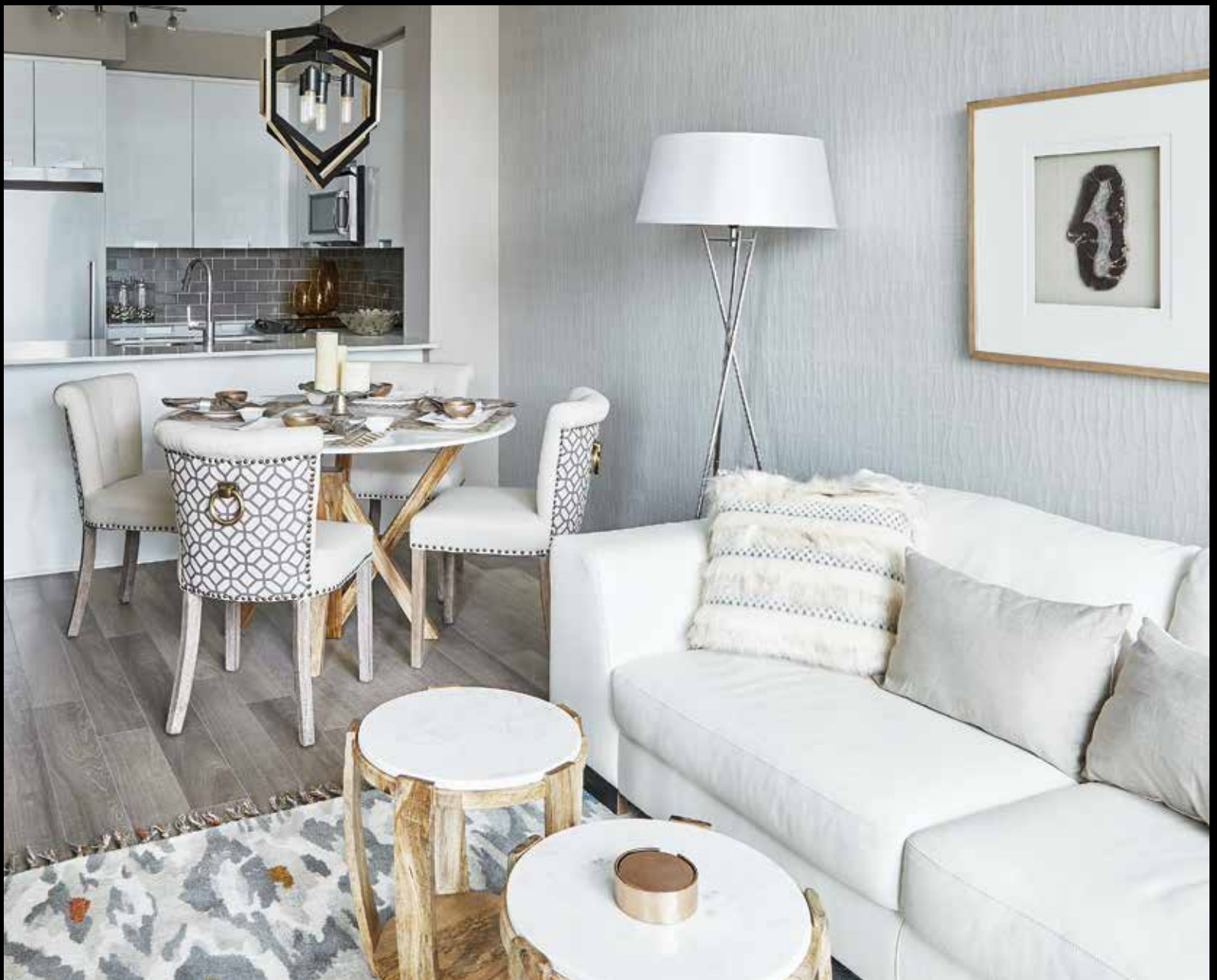
Model Suite at Perla.

Perla, Pinnacle Uptown's lustrous new addition consists of two unique oval towers surrounded by all the advantages of downtown Mississauga. Here's a home so perfectly desirable, it's precious.