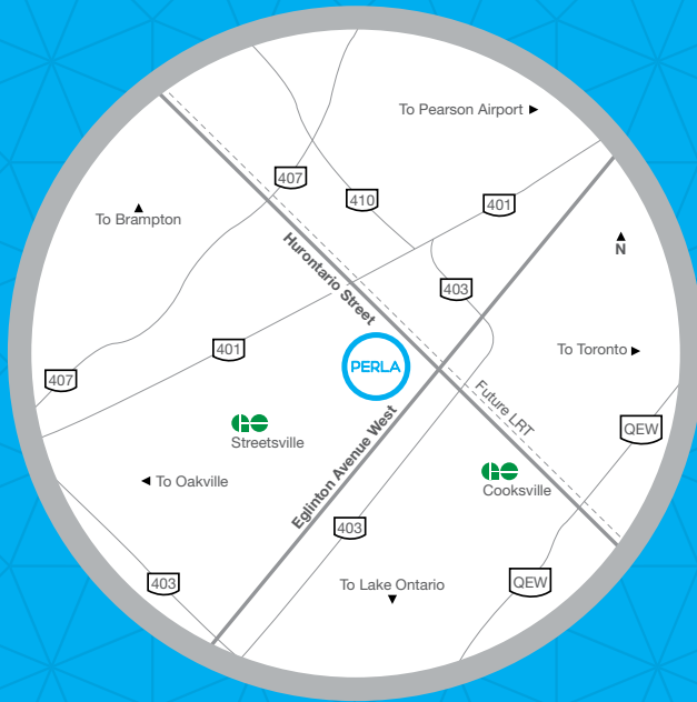
Map is not to scale. E. & O. E.