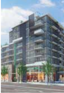
Pinnacle Living Broadway, Vancouver

Based in Vancouver, British Columbia, Pinnacle International has been one of Canada's premiere builders of luxury condominium residences for over four decades. Pinnacle's portfolio includes landmark communities in Vancouver, Toronto, Mississauga and San Diego. A Pinnacle community is always place-perfect, with an élan of its own.