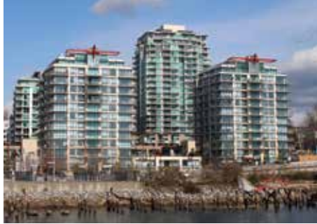
Atrium at the Pier, North Vancouver